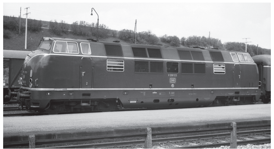
V 200 123 in Rottweil im Mai 1965

Although the machines of the V 200.0 proved themselves very well, at the end of the 1950s, due to the increased volume of traffic, it became necessary to procure a more powerful advanced series for the fast and heavy passenger train service.